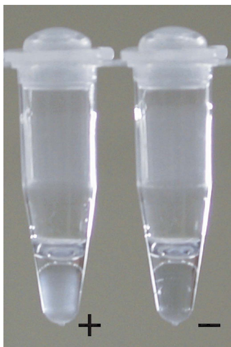
Figure 2. Detection of DNA fragments synthesized by LAMP reaction. White precipitate of magnesium pyrophosphate yielded by LAMP reaction (+). Negative