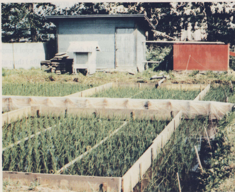
Plate 2 Apparatus for cool water irrigation.