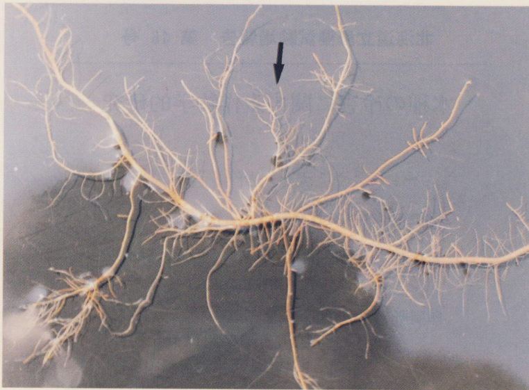
Plate 4 A root branched up to 4th order in a compost plot.